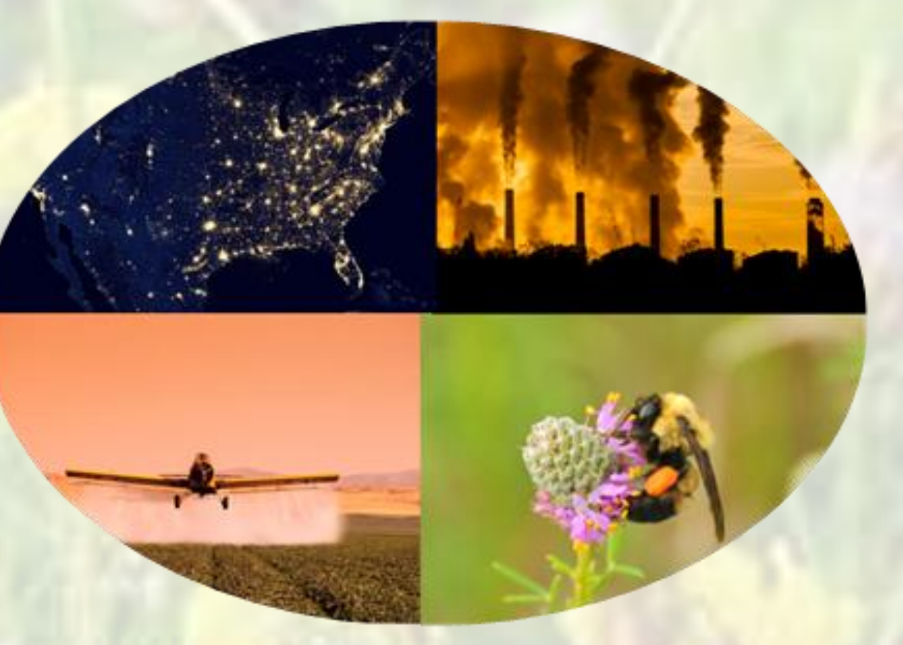
Pollution, including pesticides

Plants or animals brought here from other places can decrease the quality of pollinator habitat. When non-native shrubs like autumn olive and multiflora rose take over open fields, they crowd out the wildflowers needed by certain butterfly and bee species for survival. Introduced parasites, such as the varroa mite, have severely compromised honey bee colonies.