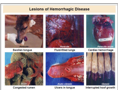
Photos of EHD in White-tailed deer from the Field Manual of Wildlife Disease in the SE US. University of Georgia /Southeastern Cooperative Wildlife Disease Study (SCWDS)

http://vet.uga.edu/population_health_files/hemorrhagic-disease-brochure-2013.pdf