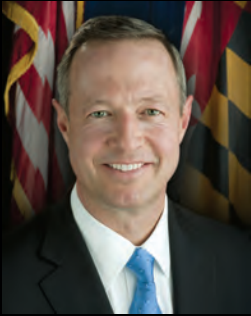
Governor Martin O'Malley