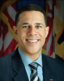
Lt. Governor Anthony G. Brown