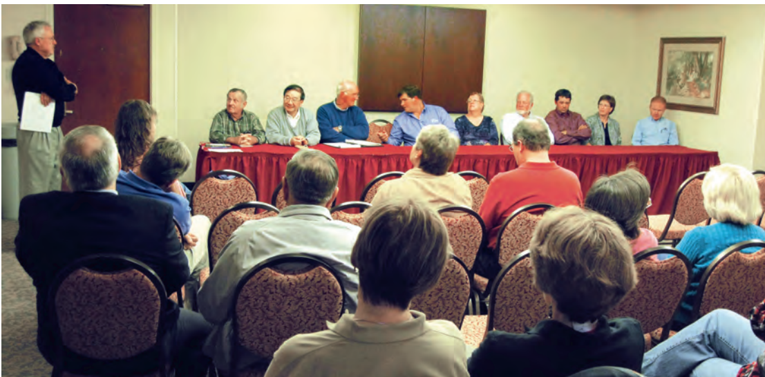
Agricultural Commissioners held a public hearing in Garrett County to discuss issues and concerns with local residents.