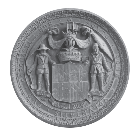
Annapolis, Maryland December 2012